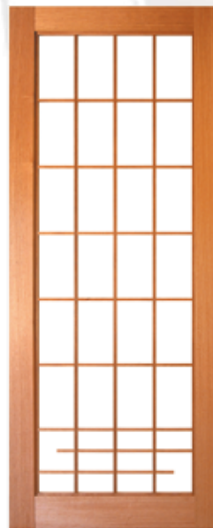
Design 4 The Nara