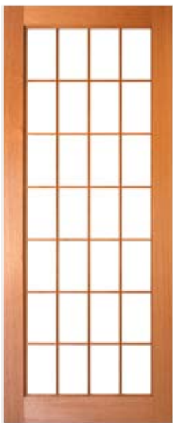
Design 1 The Kyoto