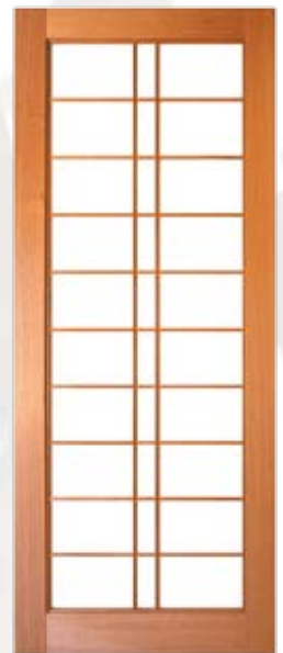
Design 7 The Tokyo