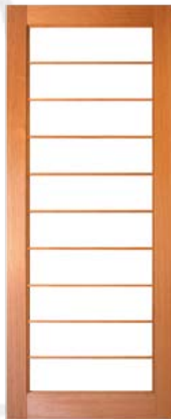
Design 3A The Geisha