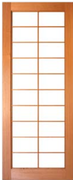
Design 3 The Fuji